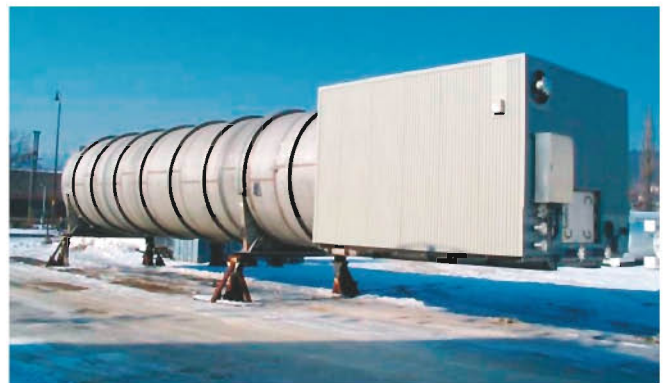
LNG fuel tank for ship built by Chart Ferox, a.s. – capacity 125 m 3 .