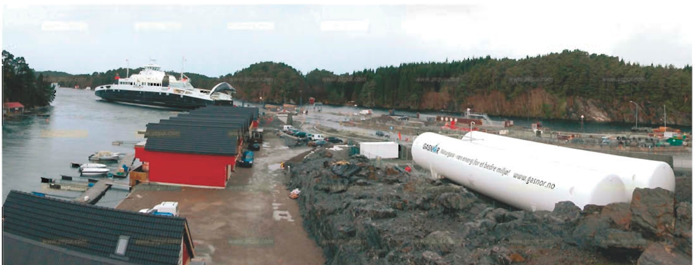
Chart also supplies the on-shore fueling terminal for ship