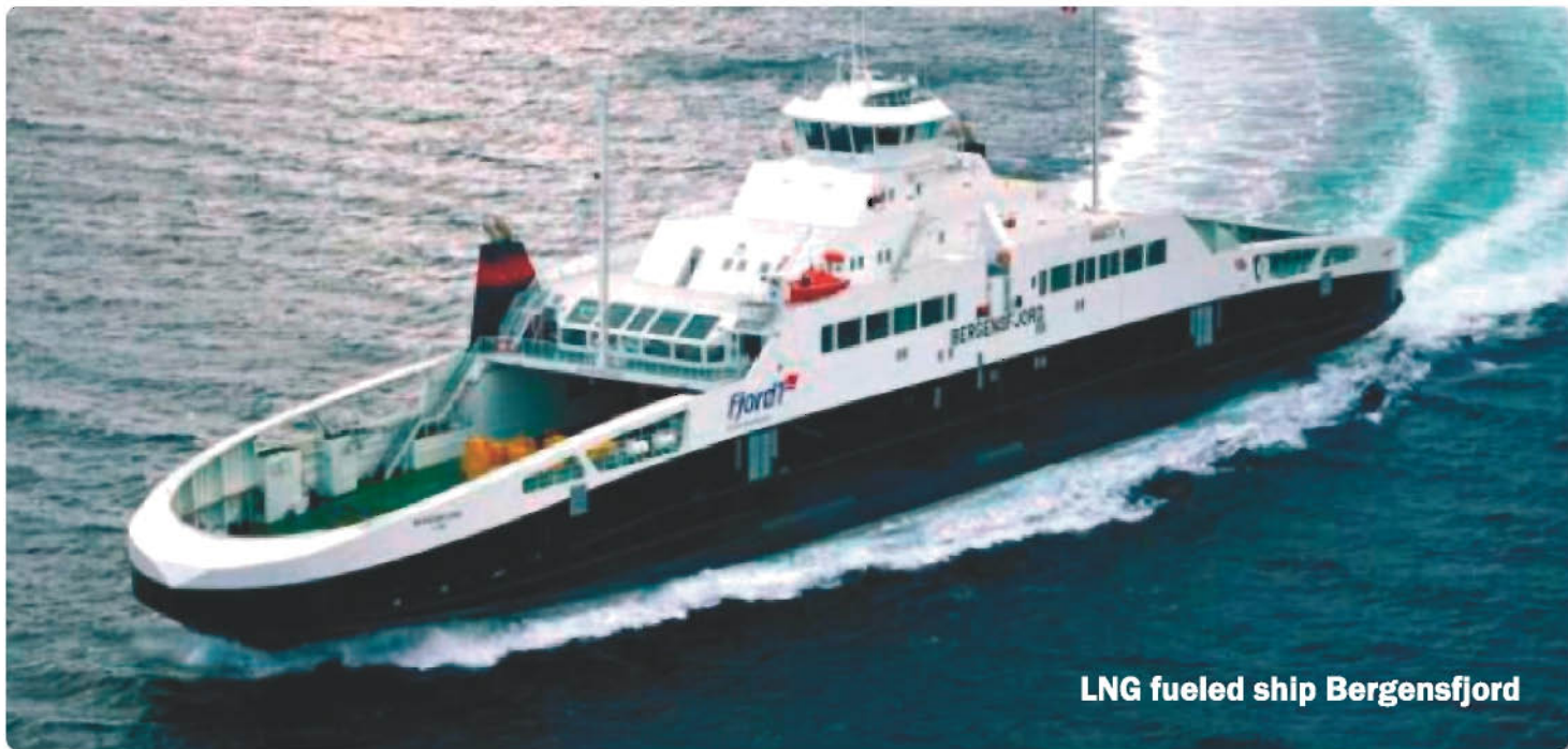
LNG fueled ship Bergensfjord

Are you in a need to meet ECA limits? Do you want to use clean energy?